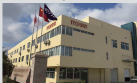
4 Shanghai Moririn Textile Co., Ltd. Qingdao Branch