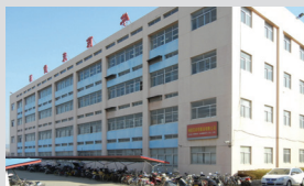
1 Qixia Morica Garments Co., Ltd.