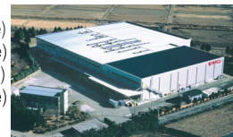
Moririn Logistics Co., Ltd. (Tsukuba Centre)