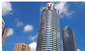
6 Shanghai Moririn Textile Co., Ltd.